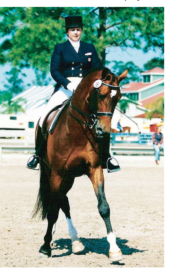
FROM PONIES TO WARMBLOODS: With the Dutch Warmblood stallion Idocus

Nationally, Gray continued to rake in the awards, as well. Always open to